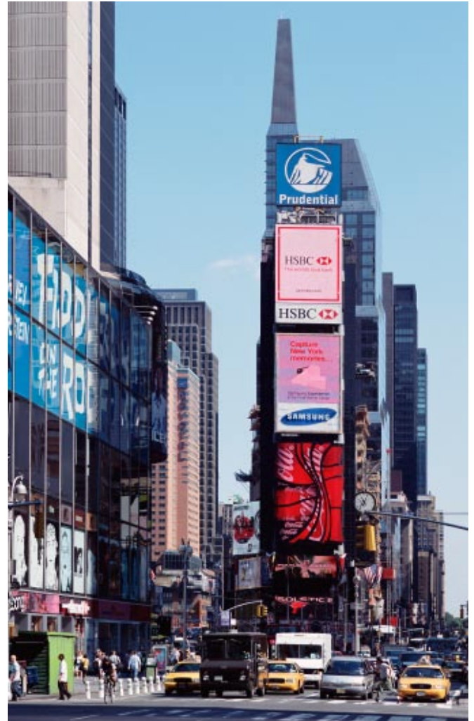
2 Times Square in New York City, the north end of the number-one branding location in the world

Sherwood Outdoor hired EnviroNet Systems, a Manhattan-based systems integrator, to research, select and build a monitoring system based on wireless technology. After an exhaustive online search, and a thorough evaluation and testing period, Sherwood Outdoor decided to go with AlarmAgent.com ® , a